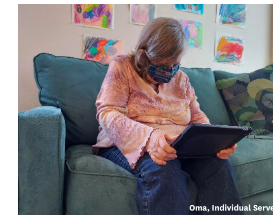
Oma, Individual Served