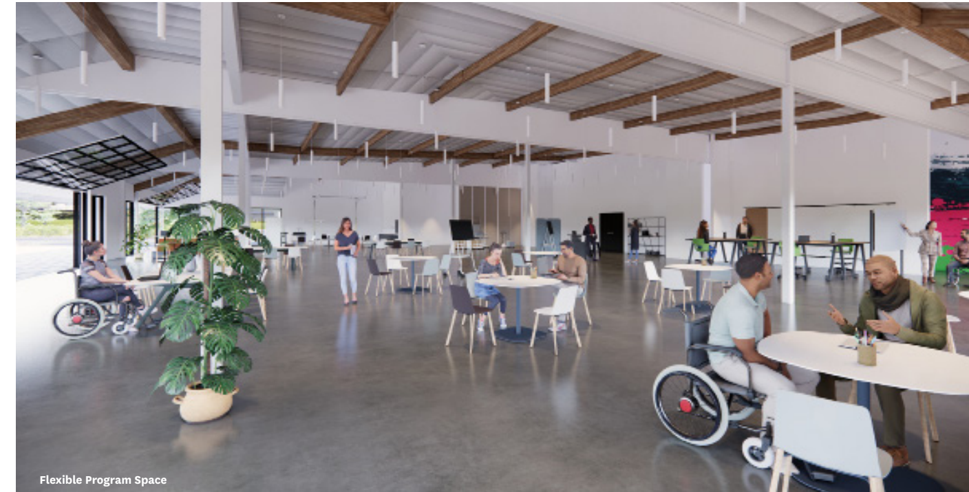
Flexible Program Space